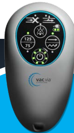
V.A.C.Via™ Therapy Unit