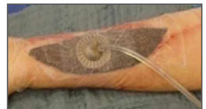
C) V.A.C.Via™ Therapy over mesh-graft coverage