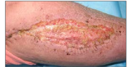
D) Wound on postoperative Day 6 after V.A.C.Via™ Therapy dressing was removed