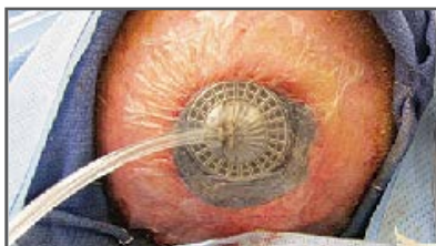
E) Application of NPWT over STSG