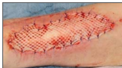
B) Intraoperative after mesh-graft coverage