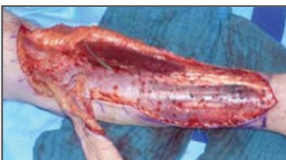
A) Soft tissue findings after debridement before mesh-graft coverage