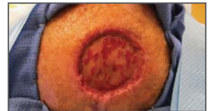
C) Postoperative Day 24 after application of V.A.C.Via™ Therapy System over Integra® and before STSG