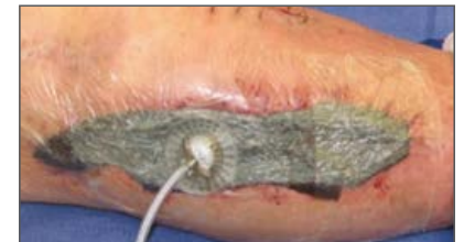
C) Application of V.A.C.Via™ Therapy System over STSG

On postoperative Day 6, the patient returned to the outpatient clinic and the V.A.C.Via™ Therapy dressing was removed. There was an approximately 100% graft take with good aesthetic results.