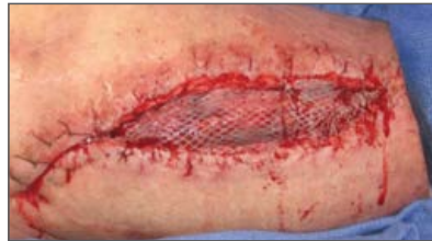
B) After two days of NPWT, an STSG was applied