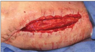
A) Wound dehiscence at presentation

Dehiscence after open reduction of tibia fracture.