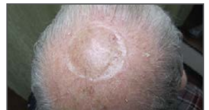
F) Follow-up - 4 months Post-STSG