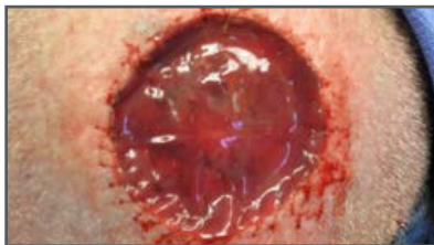
B) Application of new Integra® graft