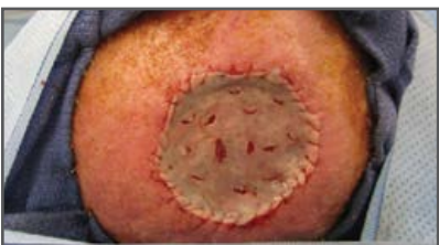
D) Application of STSG on postoperative Day 24